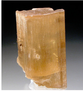
Phosgenite - Montepioni